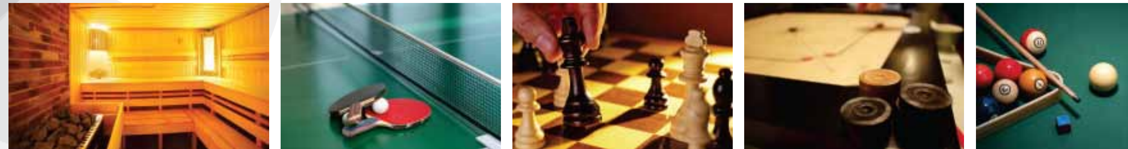
Indoor Amenities: Gym • Jacuzzi • Sauna • Steam • Billiards • Table Tennis • Carrom • Chess

If relaxation is on your mind then stretch your muscles at the world-class gym or rejuvenate in the steam facility at the health club. But if you are looking for activity then you could challenge your neighbour to an interesting game of chess or indulge in an energetic session of table tennis or snooker. The extensive indoor & outdoor gaming areas are topped with a shimmering vanishing pool on the landscaped podium adding beauty and class to this splendid development.